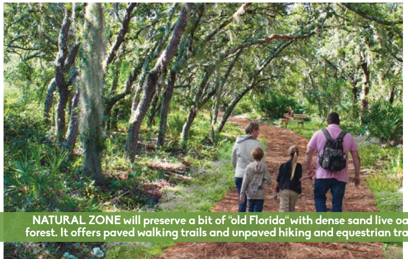
NATURAL ZONE will preserve a bit of "old Florida" with dense sand live oak forest. It offers paved walking trails and unpaved hiking and equestrian trails.