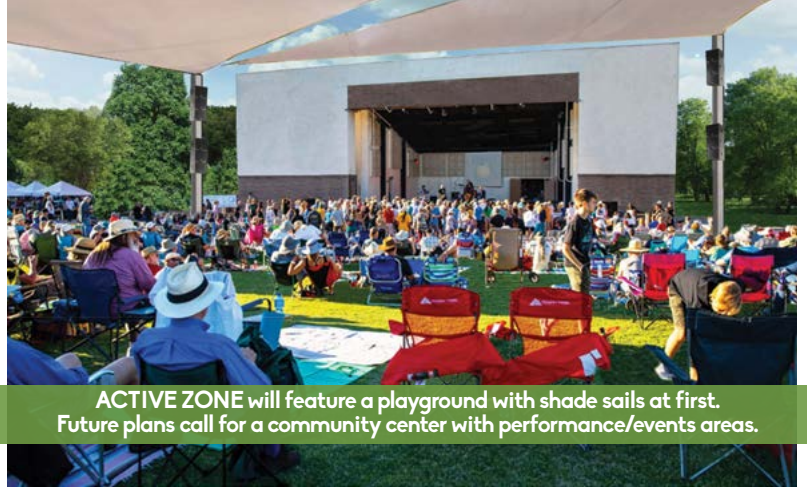
ACTIVE ZONE will feature a playground with shade sails at first. Future plans call for a community center with performance/events areas.