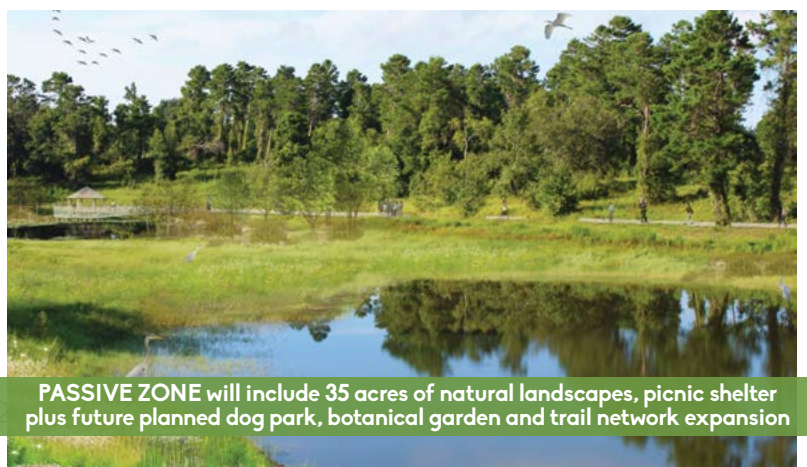
PASSIVE ZONE will include 35 acres of natural landscapes, picnic shelter plus future planned dog park, botanical garden and trail network expansion