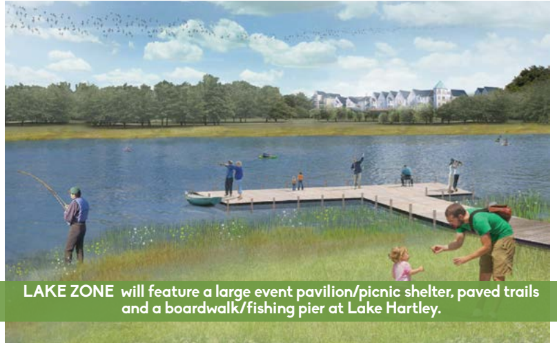
LAKE ZONE will feature a large event pavilion/picnic shelter, paved trails and a boardwalk/fishing pier at Lake Hartley.